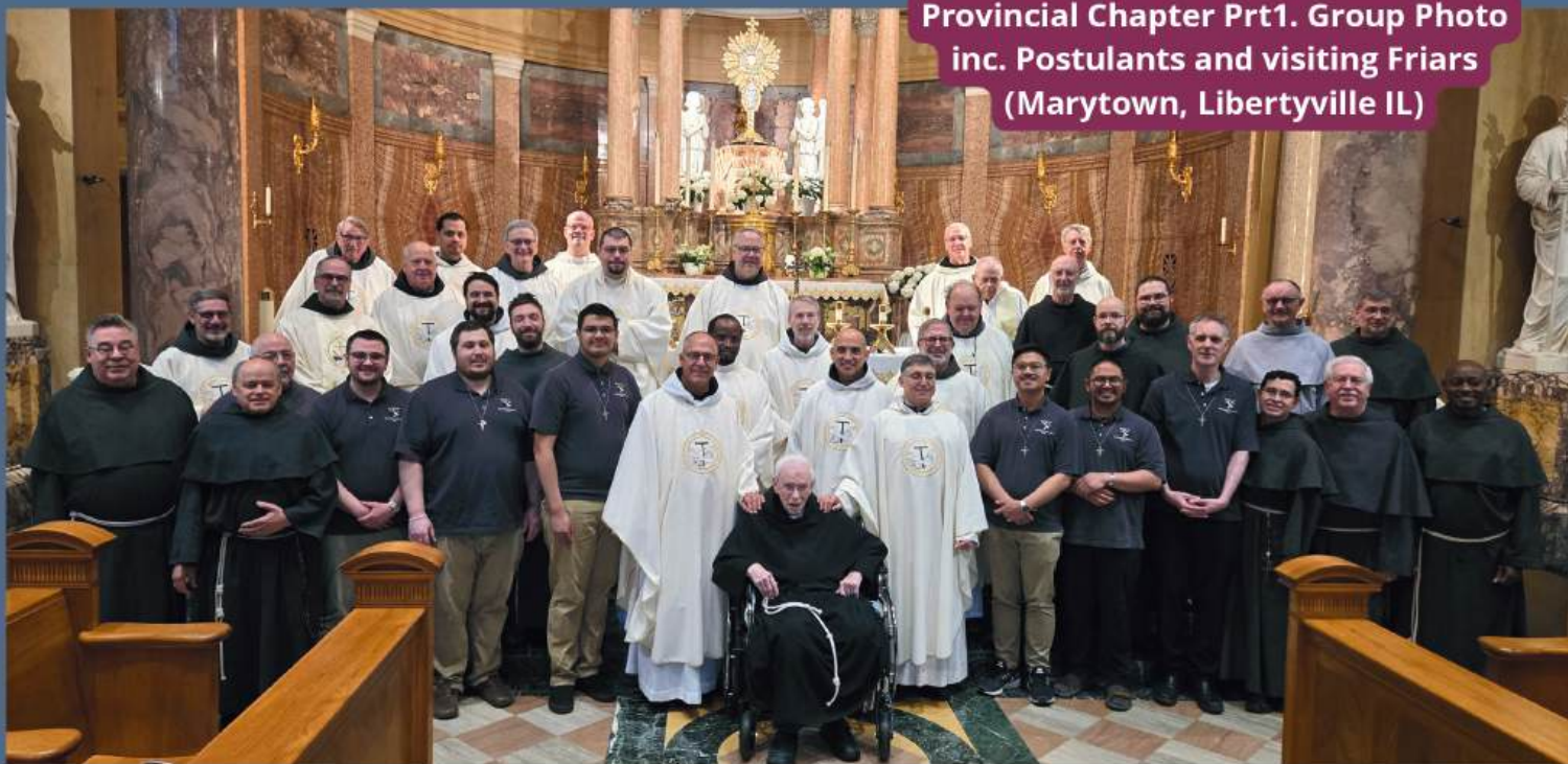
Provincial Chapter Prt1. Group Photo inc. Postulants and visiting Friars (Marytown, Libertyville IL)

Every four years, the Solemnly Professed members of the Province are required to come together, over two week-long parts, to look back over the past quadrenium, elect leadership, and set goals for the next term. Though sessions can be long, and sometimes lively, it is a great time to reflect honestly, share quality fraternity, and prayerfully discern the future together.