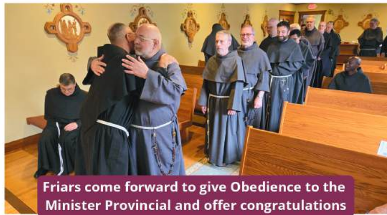
Friars come forward to give Obedience to the Minister Provincial and offer congratulations