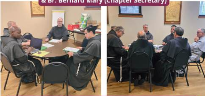
Friars participated in fruitful group sharing and discussion