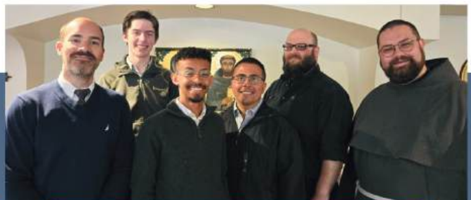
April 'Come & See' Weekend in Chicago