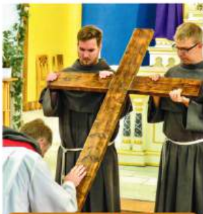
Veneration of the Cross