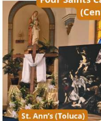
St. Ann's (Toluca)