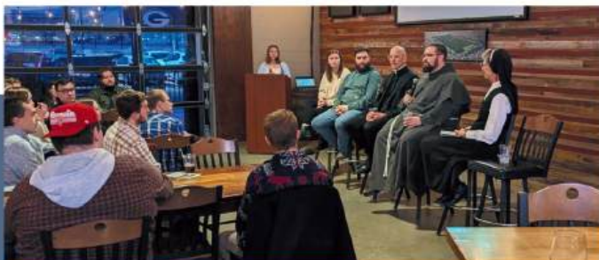
Theology on Tap Vocations Pannel, Green Bay, WI

Over the weekend of April 17-19, we held our first 'Come & See' weekend for 2026. Seven men were in attendance (one went home sick), and each expressed how much they enjoyed the experience and opportunity to engage with the community and learn more about the Franciscan life and our Province of St. Bonaventure. KEEP PRAYING FOR VOCATIONS!