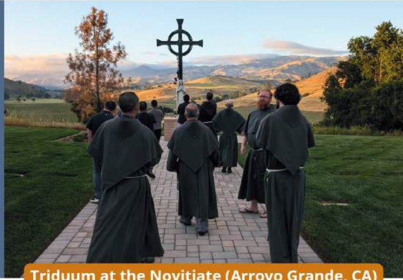
Triduum at the Novitiate (Arroyo Grande, CA)