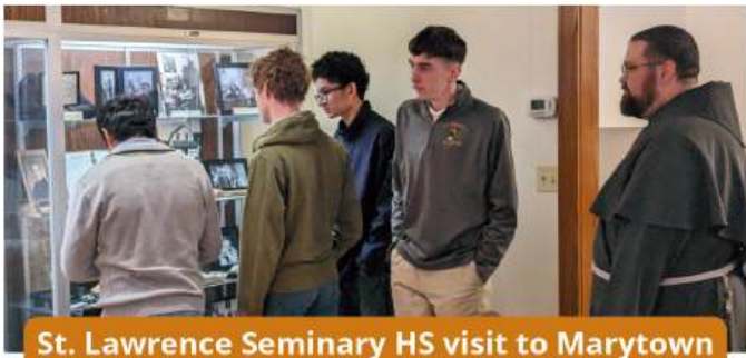
St. Lawrence Seminary HS visit to Marytown