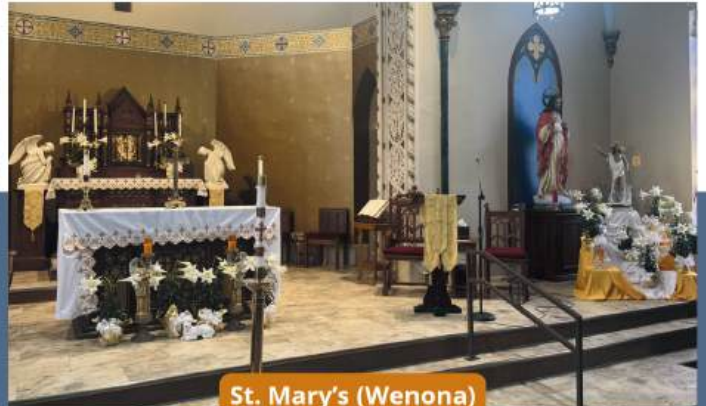
St. Mary's (Wenona)