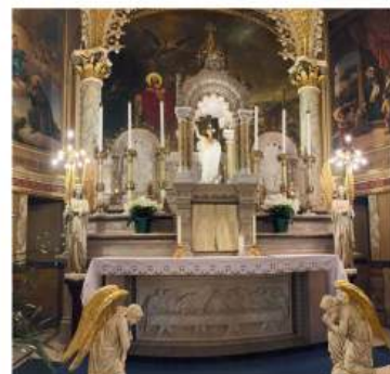
National Shrine of St. Maximilian Kolbe at Marytown (Libertyville, IL)