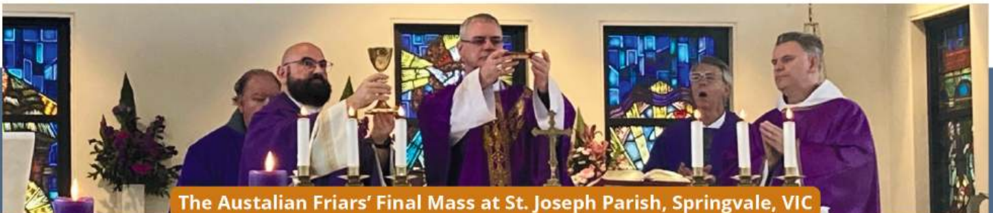
The Austalian Friars' Final Mass at St. Joseph Parish, Springvale, VIC Melbourne Archbishop Peter Comensoli presiding