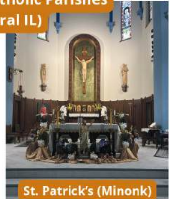
St. Patrick's (Minonk)