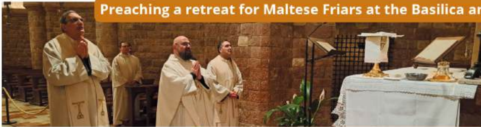
Preaching a retreat for Maltese Friars at the Basilica and Tomb of St. Francis