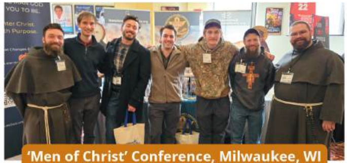
'Men of Christ' Conference, Milwaukee, WI