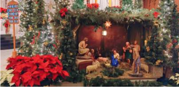
All Saints Friary (Dearborn Heights, MI)