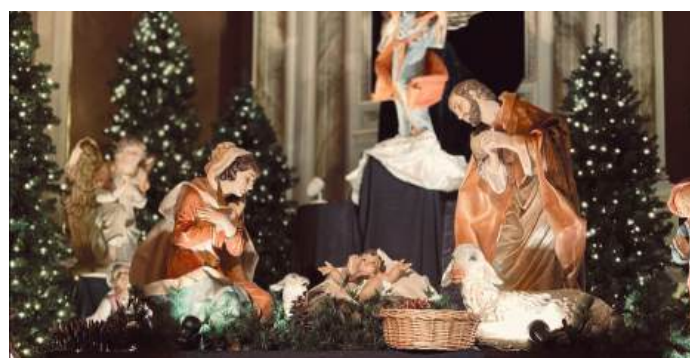
National Shrine of St. Maximilian Kolbe, 'Marytown' (Libertyville, IL)