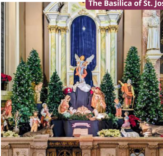
The Basilica of St. Josaphat (Milwaukee, WI)