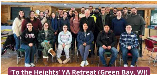
'To the Heights' YA Retreat (Green Bay, WI)