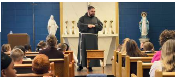
Archangels Academy Vocations Day (Union, IL)

The Vocation Office thanks you all greatly for your ongoing support and prayers, as we see the fruits of them now with this increased interest in our Conventual Franciscan life, especially with our Midwest Province of St. Bonaventure.