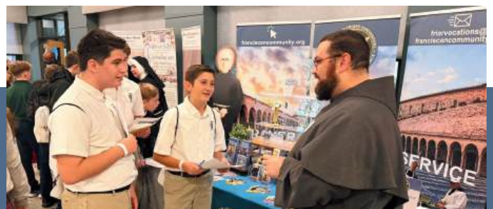
Joliet Diocese Vocation Fair (Joliet, IL)