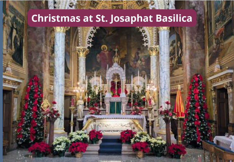
Christmas at St. Josaphat Basilica