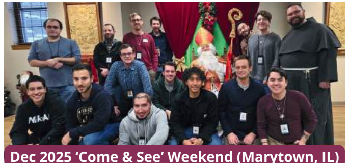
Dec 2025 'Come & See' Weekend (Marytown, IL)