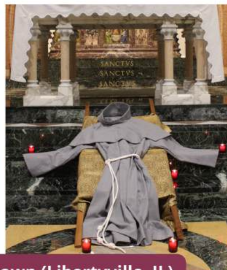
National Shrine of St. Maximilian Kolbe - Marytown (Libertyville, IL)