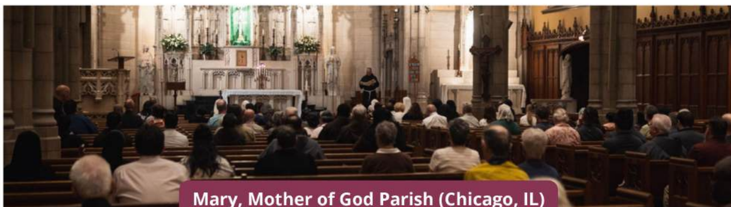
Mary, Mother of God Parish (Chicago, IL)