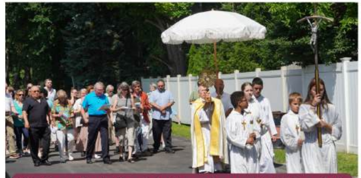
St. Anselm's Parish (Dearborn Heights, MI)