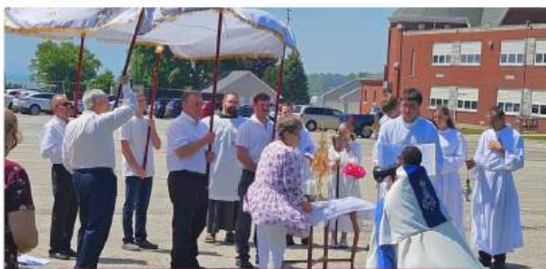
St. Mary's Parish (Algoma, WI)