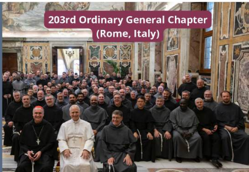
203rd Ordinary General Chapter (Rome, Italy)

From Our Provincial - 1 Corpus Christi Processions - 2 Mission Advancement - 3 Postulants & Novices - 4 & 5 Simple Vows - 6 News from the Apostolates - 7 Upcoming Events - 11