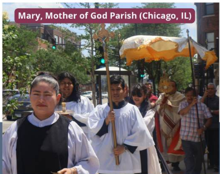
Mary, Mother of God Parish (Chicago, IL)