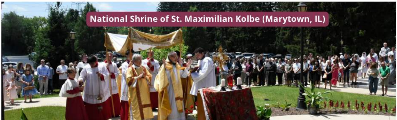
National Shrine of St. Maximilian Kolbe (Marytown, IL)