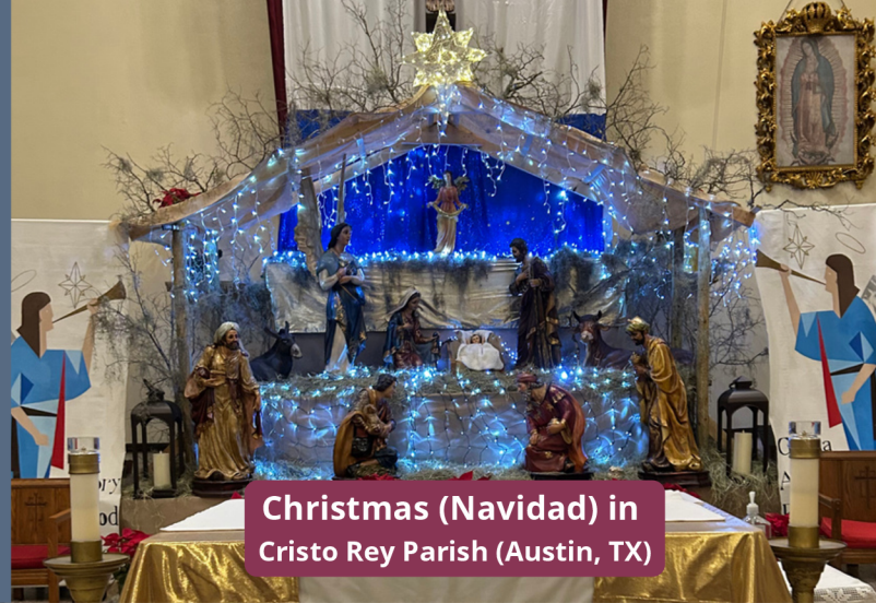
Christmas (Navidad) in Cristo Rey Parish (Austin, TX)