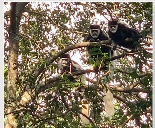
One more photo from Kenya!