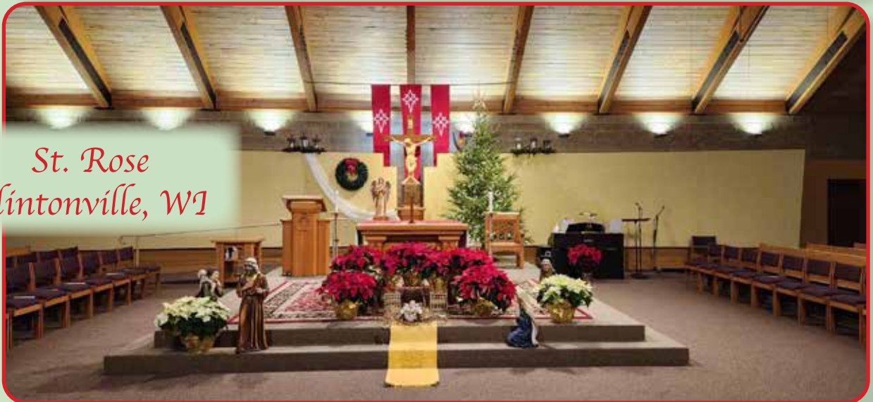
St. Rose Clintonville, WI