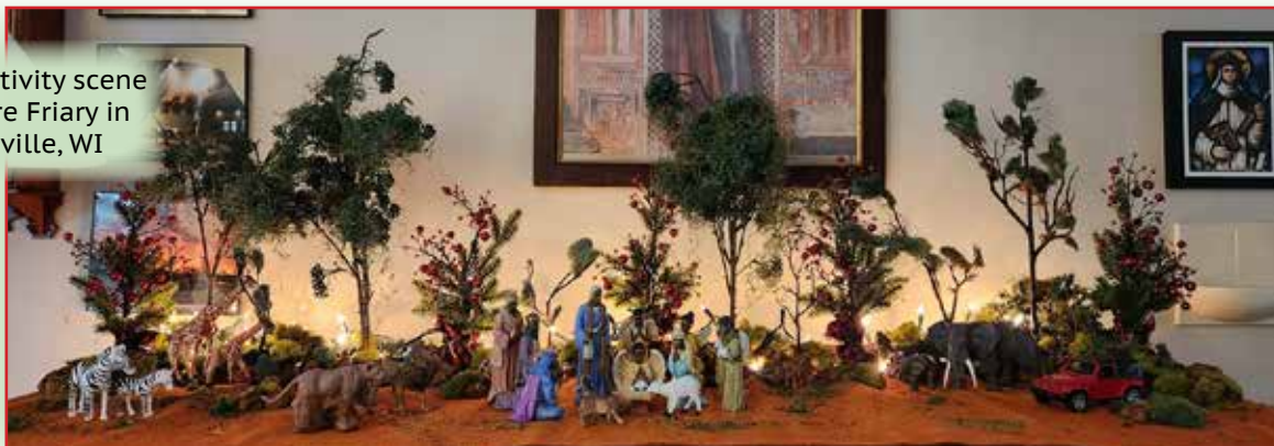
Kenyan Nativity scene at St. Clare Friary in Clintonville, WI