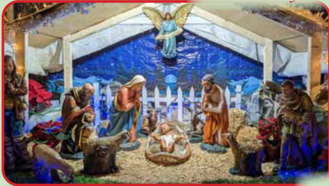
Mary, Mother of God