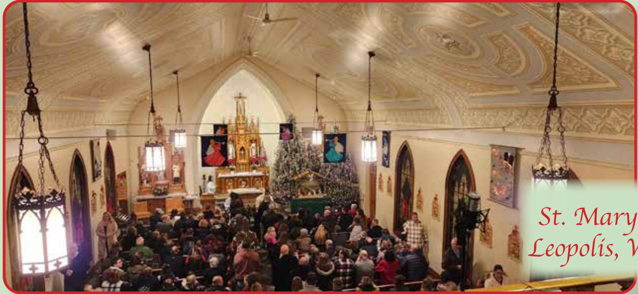
St. Mary's Leopolis, WI