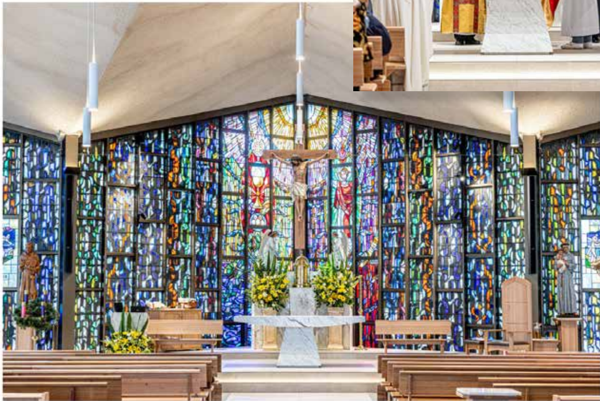
A view of the newly renovated Our Lady of the Rosary Parish, Kellyville.

Excerpt from Catholic Outlook, news from the Diocese of Parramatta: You can view the full article and many more photos at https://catholicoutlook.org/kellyville-parish-looks-forward-to-the-future-with-a-new-church-fitout-for-generations-to-come/