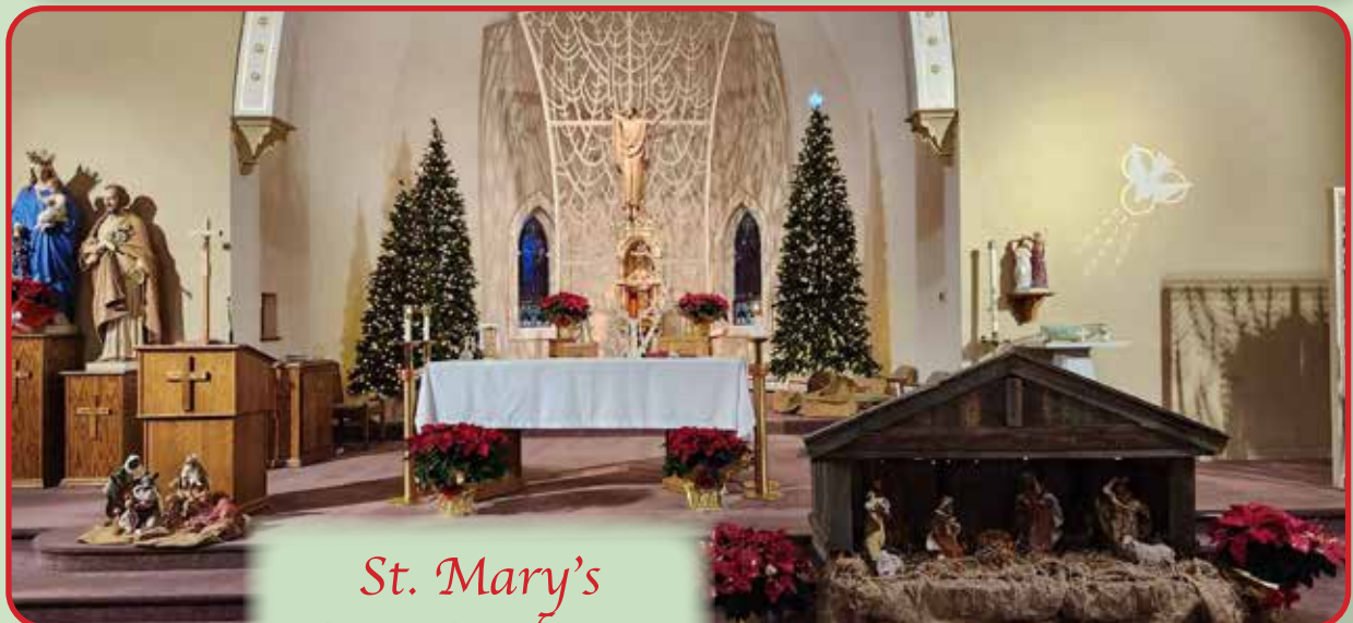
St. Mary's Bear Creek, WI