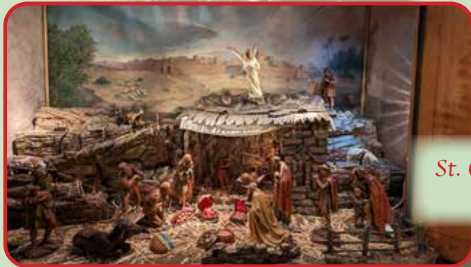
St. Gregory the Great