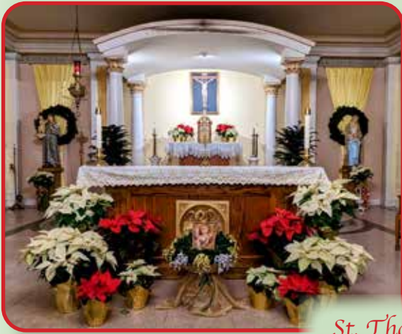
St. Thomas of Canterbury