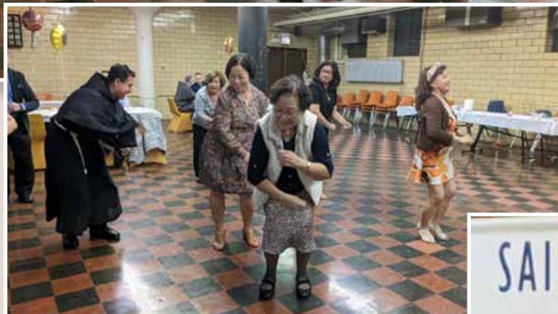
The Welcome Back Dinner Dance was hosted on September 24 by the Filipinos of St. Gregory the Great, a group that has been active since 1987. Proceeds support parish projects.