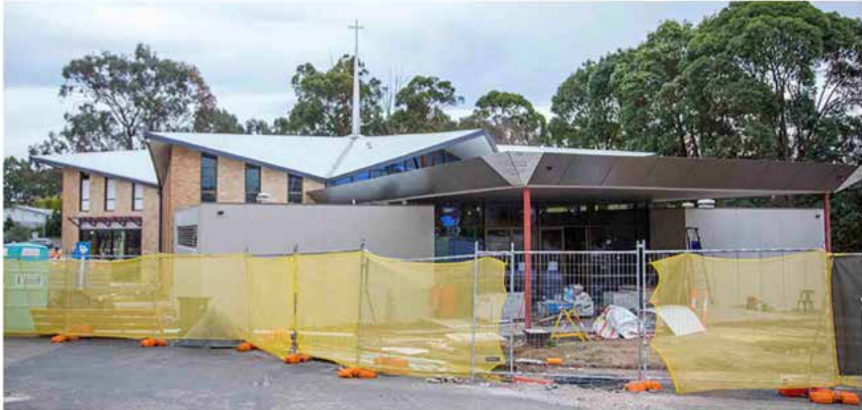
A view of the renovation project at Our Lady of the Rosary Parish, Kellyville, in August 2022.

The parish community of Our Lady of the Rosary Parish, Kellyville, are rejoicing after officially celebrating their 50 th anniversary – two-and-a-half years later.