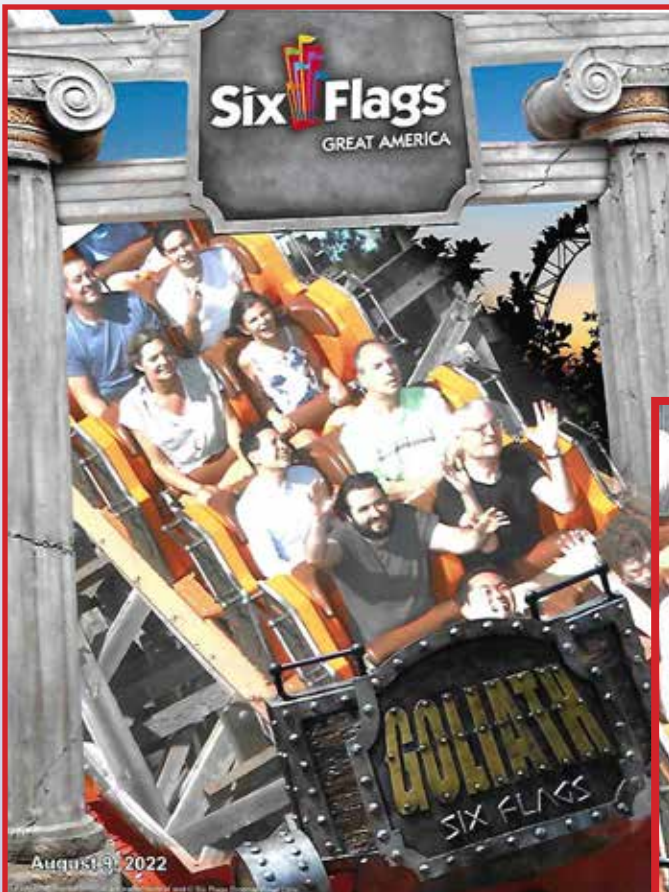
Several friars enjoyed a day at Six Flags on August 9th. A good time was had by all!