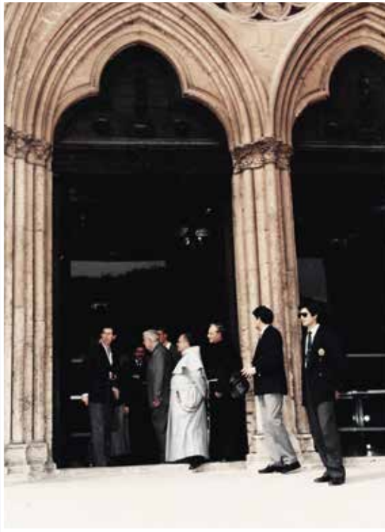
Prince Charles welcomed at entrance to Lower Basilica in Assisi

The Prince admired St Francis, noting that he still speaks to our contemporaries in the various aspects of his life. He admired the pre-Renaissance art and religious life.