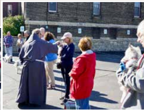
Blessing of the Animals at the Basilica