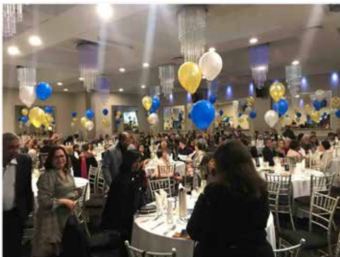
A view of the 50th Anniversary dinner-dance celebration and fundraiser for Our Lady of the Rosary Parish, Kellyville.

“Our Anniversary dinner-dance was a real relief and a release of our need to be present for one another.”