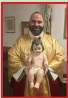
Photographs from: Tarcisius in Assisi (top); St. Gregory; St. Thomas of Canterbury; and Marytown