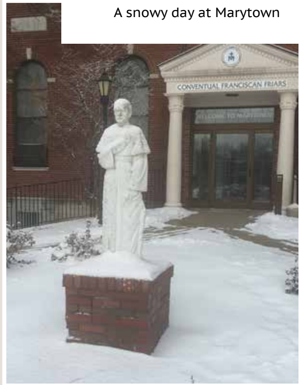
A snowy day at Marytown