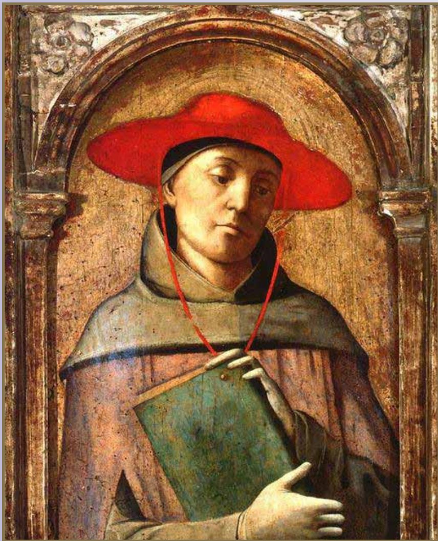
St. Bonaventure Painting by Alvise Vivarini (1442-1505) McNay Art Museum San Antonio, Texas

We must suspend all operations of the mind and we must transform the peak of our affections, directing them to God alone. This is a sacred experience.