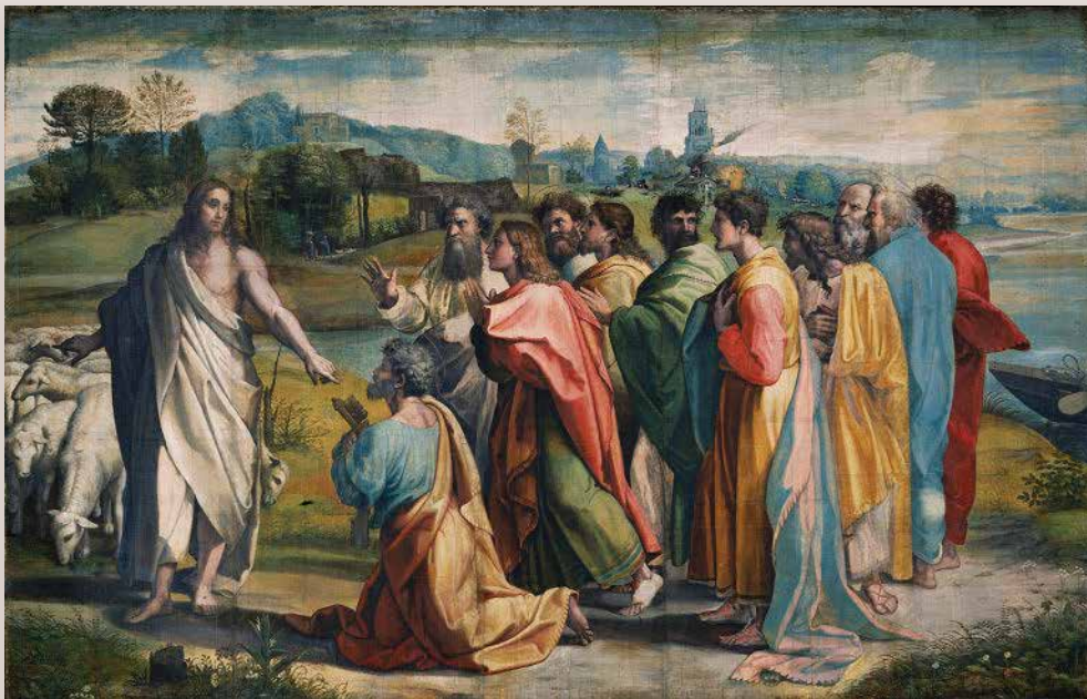
Painting by Raphael (c. 1515) Christ's Charge to Peter

We are an Easter people and Alleluia is our song!