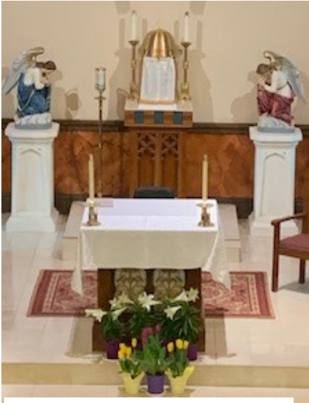
Sacred Heart Farmer City