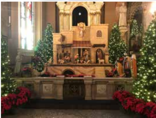
Basilica of St. Josaphat, Milwaukee