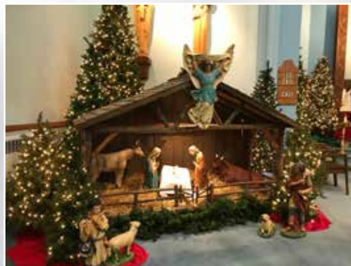
St. Patrick, Minonk