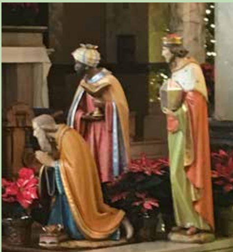
The Magi at the Basilica of St. Josaphat