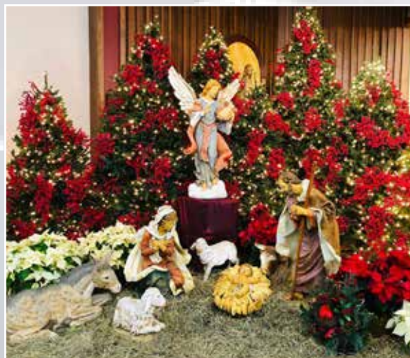
Holy Family, Peoria