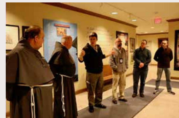
Top two photos: October Come & See Bottom three: December