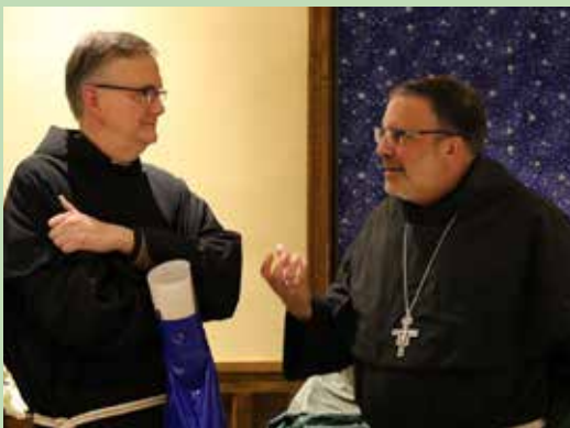
More Epiphany photos on page 6