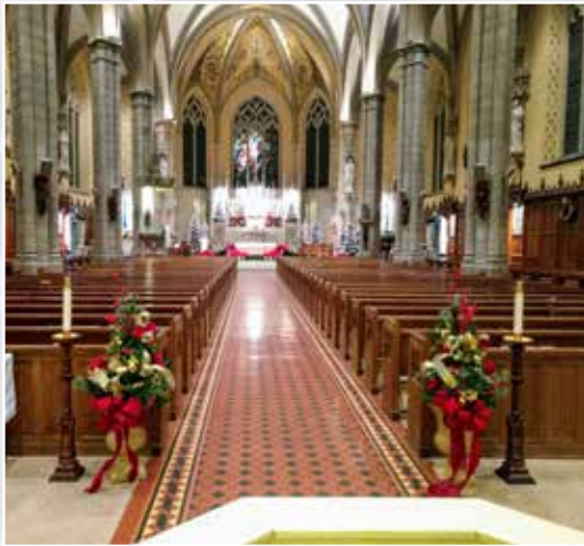
St. Ita, Chicago