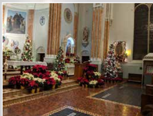
St. Anthony of Padua, Rockford