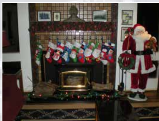
Novitatz, Arroyo Grande