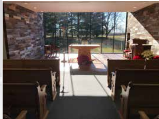
St. John the Baptist, Lostat