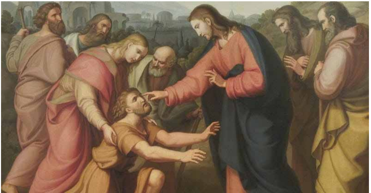
Painting: Václav Mánes - Healing the Blind Man (1832)