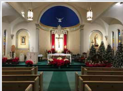
St. Ann's, Toluca