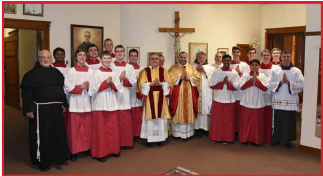
Top: Our Lady of the Rosary Parish, Kellyville, NSW, Australia Bottom: Marytown

One of our greatest gifts that we Franciscans can offer the Church is our sense of God's presence, not only in our lives but in the world around us!