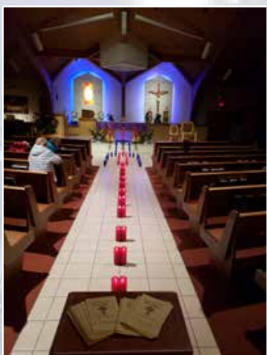
St. Linus, Dearborn Heights