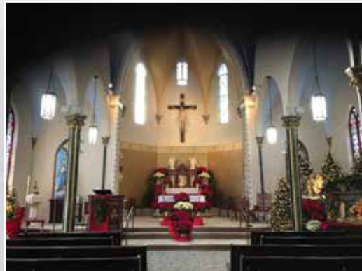
St. Mary's, Wznona