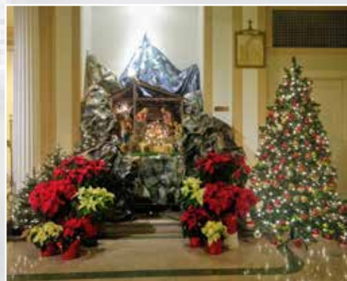
St. Thomas of Canterbury, Chicago