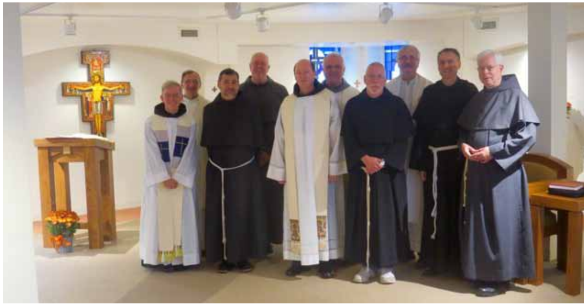
CFC meeting in Chicago, October 12-13