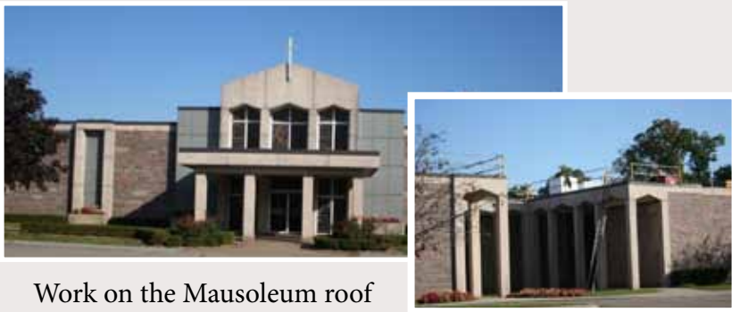
Work on the Mausoleum roof