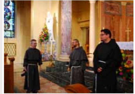
At rehearsal the morning of solemn vows