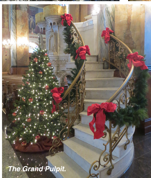
The Grand Pulpit.