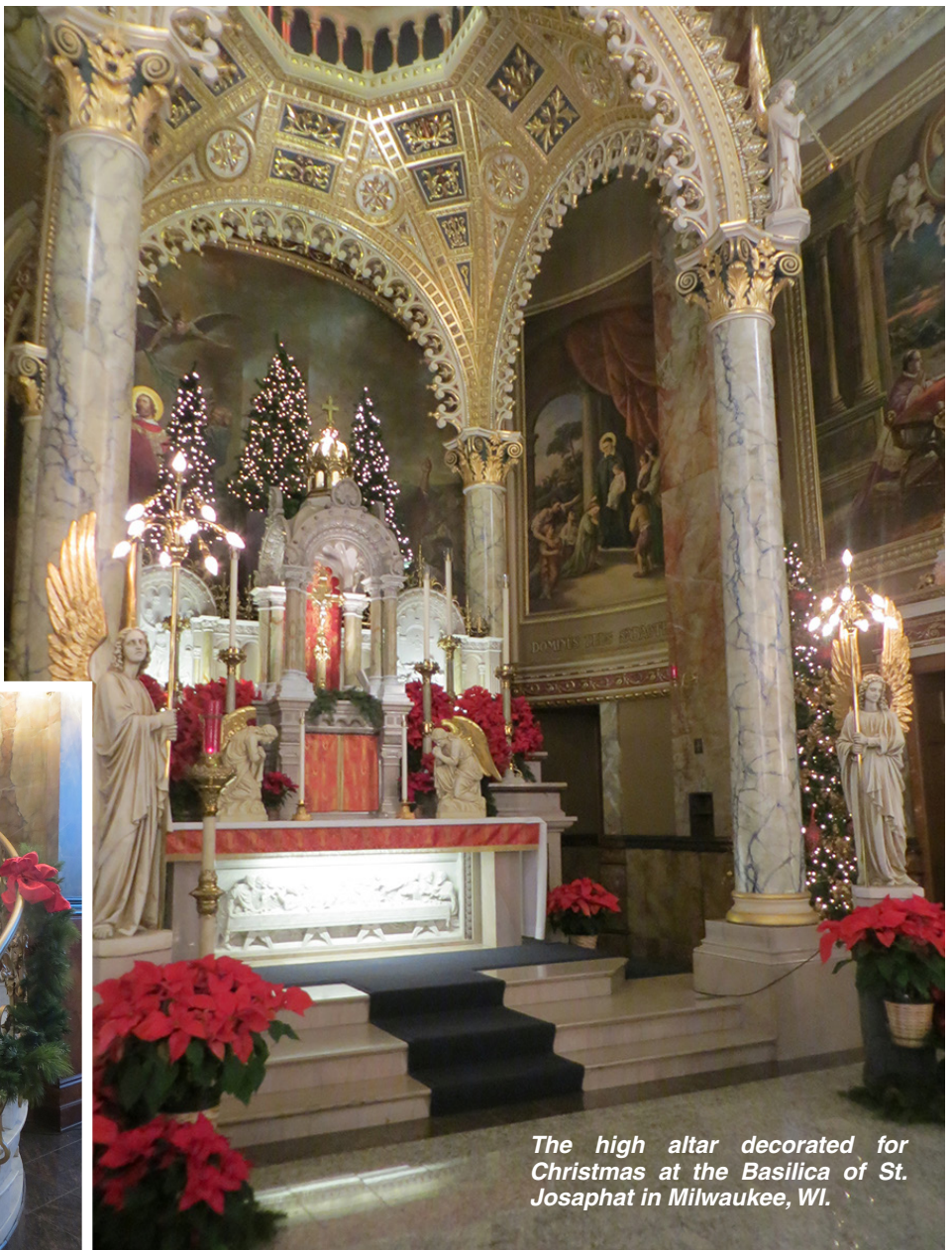
The high altar decorated for Christmas at the Basilica of St. Josaphat in Milwaukee, WI.