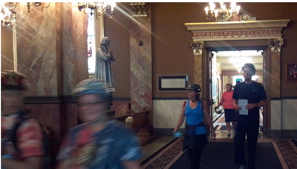
On August 11, 2013, teams of two experienced Milwaukee landmarks and businesses on an amazing urban bike adventure modeled after the TV show "Amazing Race." Participants to "Amazing Milwaukee Race on Bikes 2" traveled throughout the city searching for clues: activities and puzzles challenged participants from start to finish. The one day race was fun for all involved, including the friars at the Basilica of St. Josaphat, one of the checkpoints in the race. There, participants had to discover the translation of the words written in old Polish in the interior of the dome.