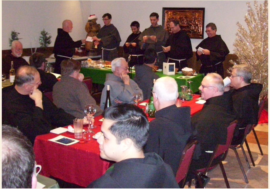
A moment from our Province Epiphany party held on January 7, 2013 at Marytown in Libertyville, IL. Novices and friars help pass out the extractions following the meal.