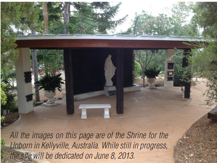
All the images on this page are of the Shrine for the Unborn in Kellyville, Australia. While still in progress, the site will be dedicated on June 8, 2013.

In the letter of St. James, we are told that faith without action is useless. It is up to each of to put our faith and our belief in the dignity and sanctity of life into practice. By doing so, we are able to echo the words of St. Paul: "Let us give thanks to the Father, who has made you worthy to share in the inheritance of the holy ones in light."