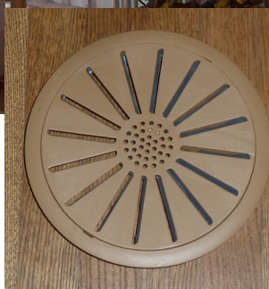
Pictured above is a sample of one of the grill covers that will be installed under the pews in the Basilica.